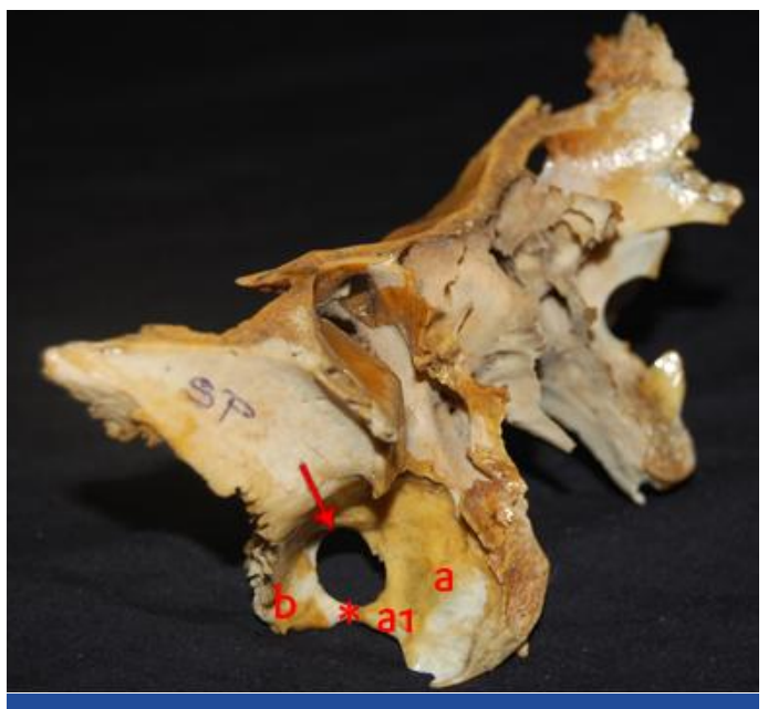
[Table/Fig-4]: Lateral view, sphenoid bone with large area of foramen of civinini (right side)

a - Lateral pterygoid; al - Spine of civinini; b - Spine of sphenoid. * - Pterygospinous bar; Arrow shows large area of foramen of civinini