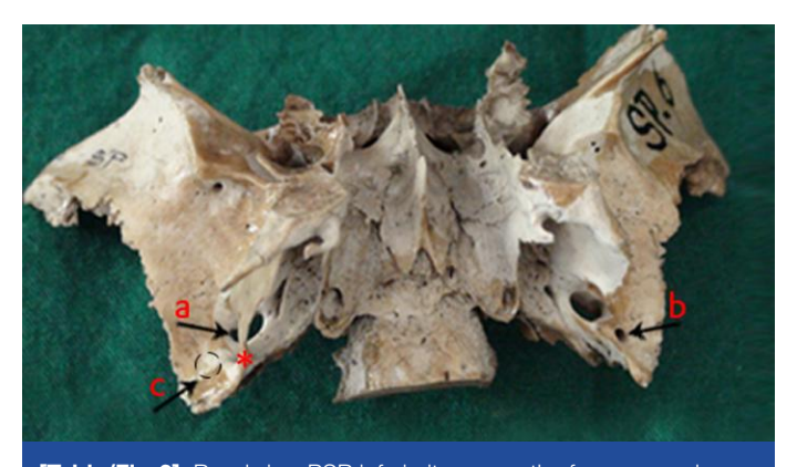
[Table/Fig-3]: Basal view PSB inferiority across the foramen ovale a - Foramen ovale; b - Foramen spinosum; c- Absence of foramen spinosum; * - Pterygospinous bar

spine of civinini. The sheet may be ossified around the perforated branches of mandibular nerve, resulting in one very small complete foramen and one accessory foramen of civinini in 0.625% of the cases.