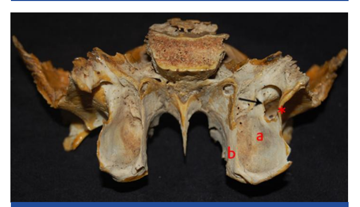
[Table/Fig-2]: Poserior view - sphenoid bone exhibits incomplete foramen of leftside and complete foramen on right side a - Lateral pterygoid plate, b - Medial pterygoid plate, * - Pterygospinous bar Arrow shows foramen of civinini

spine of civinini. The sheet may be ossified around the perforated branches of mandibular nerve, resulting in one very small complete foramen and one accessory foramen of civinini in 0.625% of the cases.